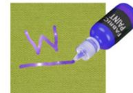
Textile paints – glitter