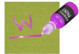
Textile paints – raised