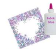
Adding sequins and shiny fabrics