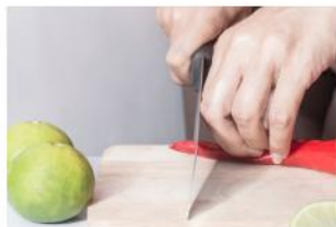
Cutting using the claw technique