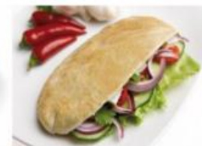
Pitta bread sandwich