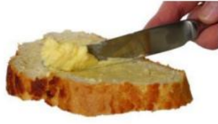
Spreading butter on bread