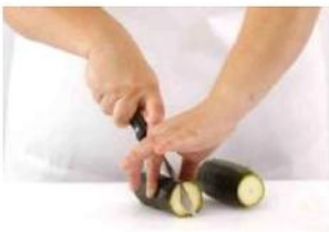
Cutting using the bridge technique