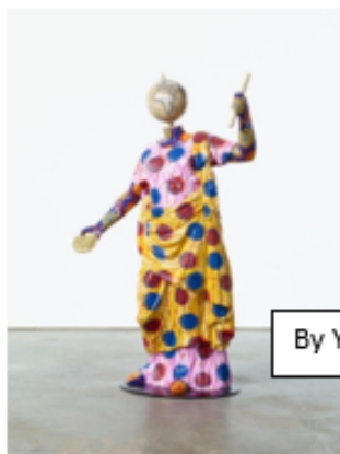
By Yinka Shonibare

Y3S3: I can clearly explain my thoughts and opinions of Artists works using key vocabulary.